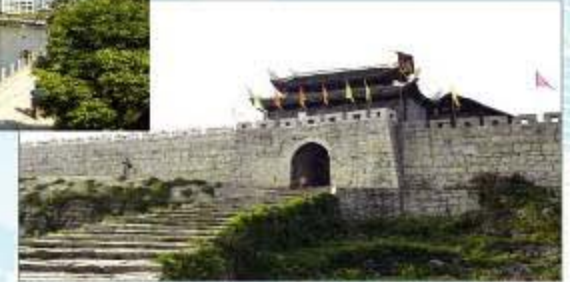
青岩古镇 Qing Yan Age-old town