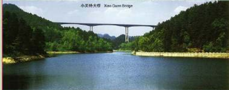
小关特大桥 Xiao Guan Bridge