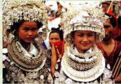
银饰 Silver Ornaments