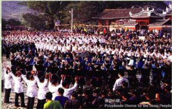
侗族大歌 Poliphonic Chorus by the Dong People