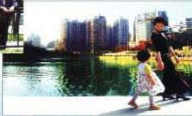
街景 Street View