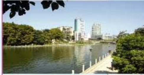
南明河 Nan ming River