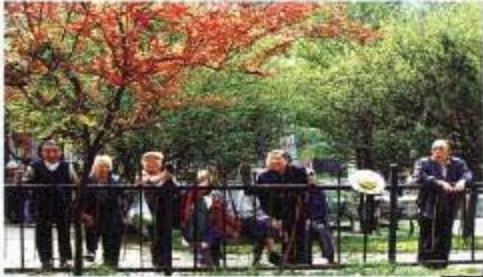
幸福晚年 Happy life in old age