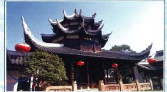
文昌阁 Wen chang Pavilion