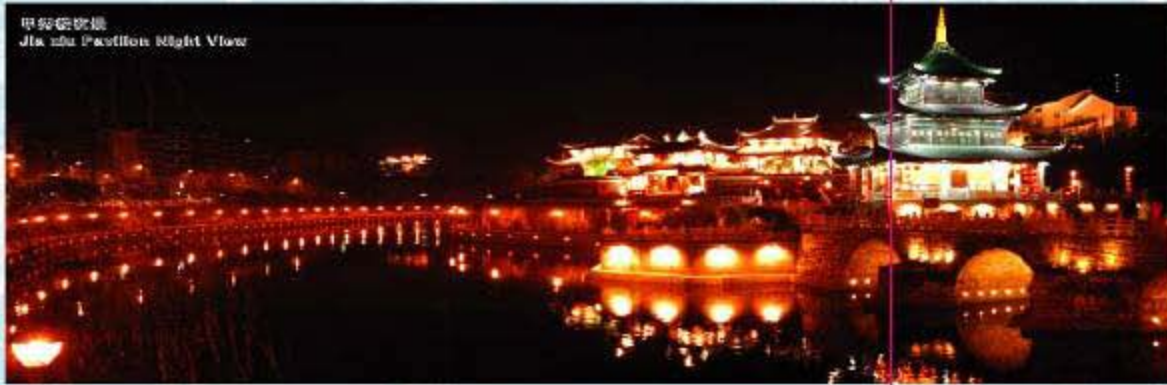
甲安碗碗景 Jia an Wan Wan Jing