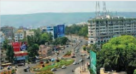
Visakhapatnam's urban environment