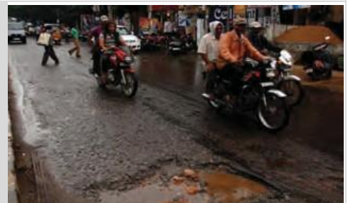
Bad road condition in urban areas