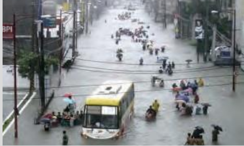
Regular floods in Davao's city center during rainy season