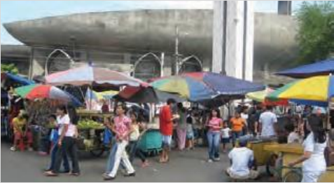
Street scene in Davao's city center