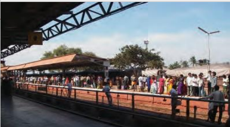
Train station in Vijayawada