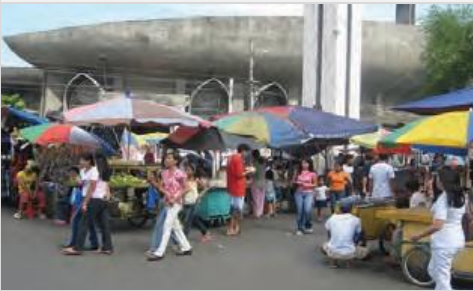
Street scene in Davao's city center