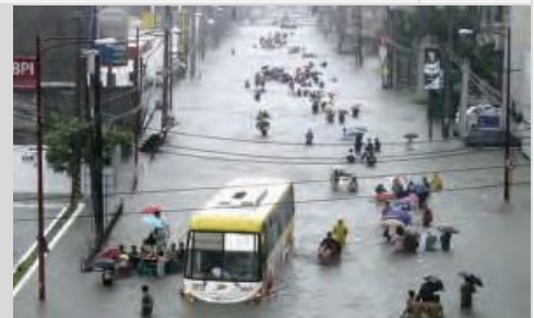
Regular floods in Davao's city center during rainy season