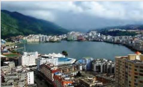
Gejiu city skyline