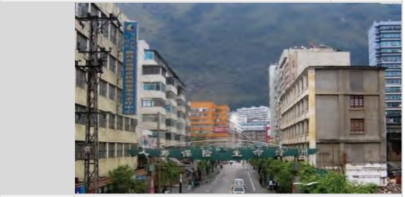
Road in Gejiu's city center