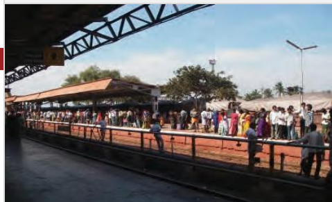
Train station in Vijayawada