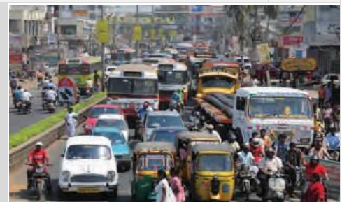
Traffic congestion in Vijayawada's urban center