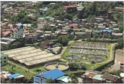
Baguio Sewerage Treatment Plant (BSTP)