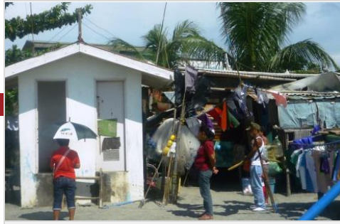
Communal Latrines on the beach in San Fernando, la Union