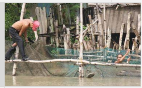
Illegal settlements living along polluted creeks