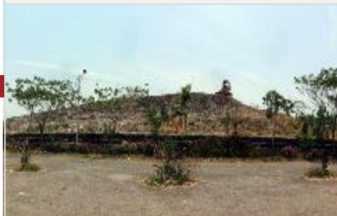
Existing Landfill that is expected to be full by 2015