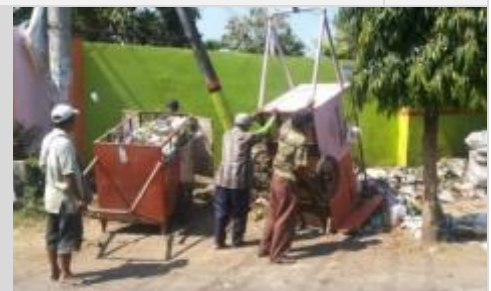
Typical Collection Point at Probolinggo City