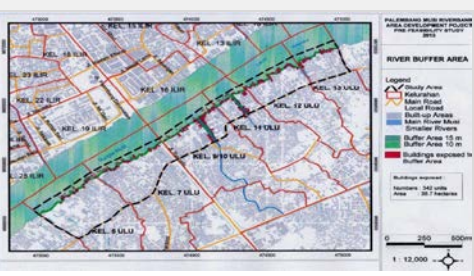
Musi Riverbank Area in Palembang