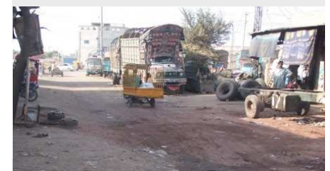
In its' effort to improve the city's transport and road infrastructure, as well as the management of industrial waste, Faisalabad is looking for new sources of project financing through Public Private Partnerships.