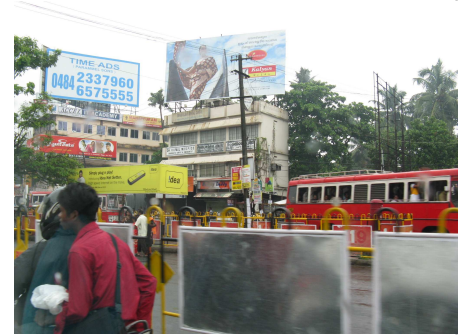
Congestion is rapidly affecting the city's competitiveness and people's quality of life and safety

Copies of the Executive Summary of the Pre-feasibility studies may be downloaded and viewed from the following link: http://cdia.asia/services/where-cdia-is-active/pakistan/pakistan-final-report-summaries/